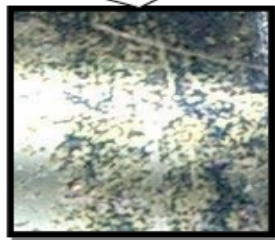
<Conventional AR coating>